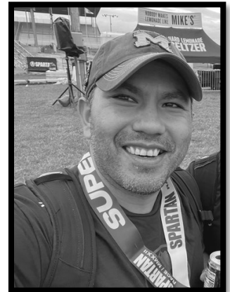
Photo at 10K Spartan Race

"The true rationale to why I began to workout more was because I was told I was getting obese in my 30s."