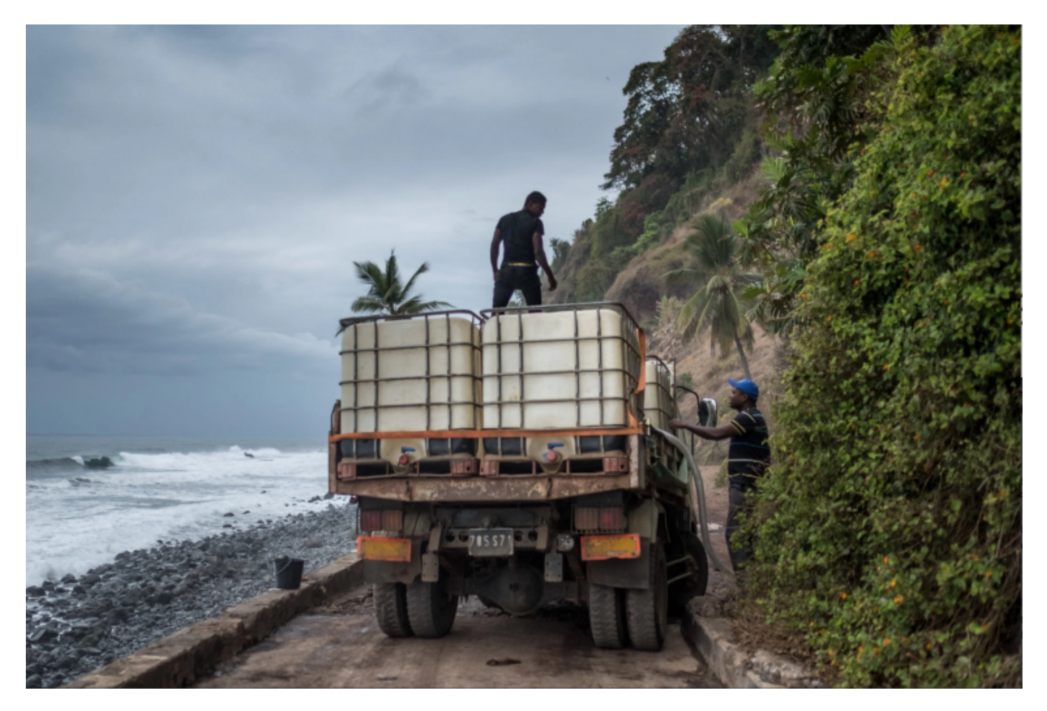
At a natural spring on Anjouan, men filled tanks with water to be transported to villages in the interior where it is in short supply. Comoros, 2019.

The scarcity of water in parts of the island is exacerbated by an antiquated distribution system which, if fixed, might take off some of the pressure. But as the population grows and the climate continues to heat up, that would only go so far.