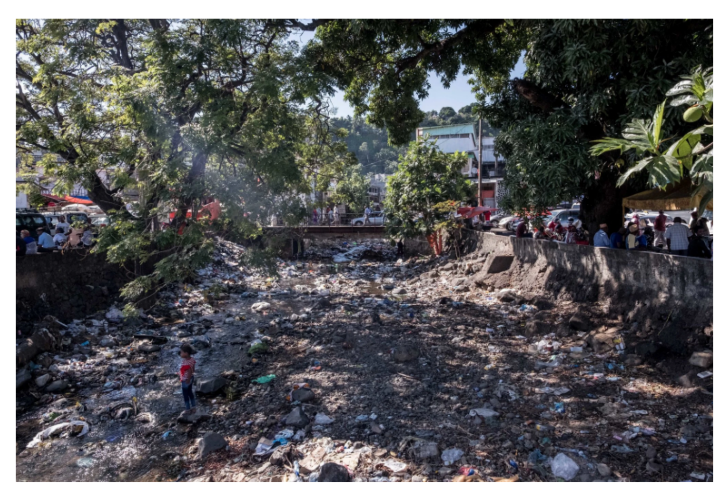
Trash littered a dry riverbed in Mutsamudu on Anjouan's north shore. Comoros, 2019.

Now, he added, "when the rainy season is over, there's no more water."