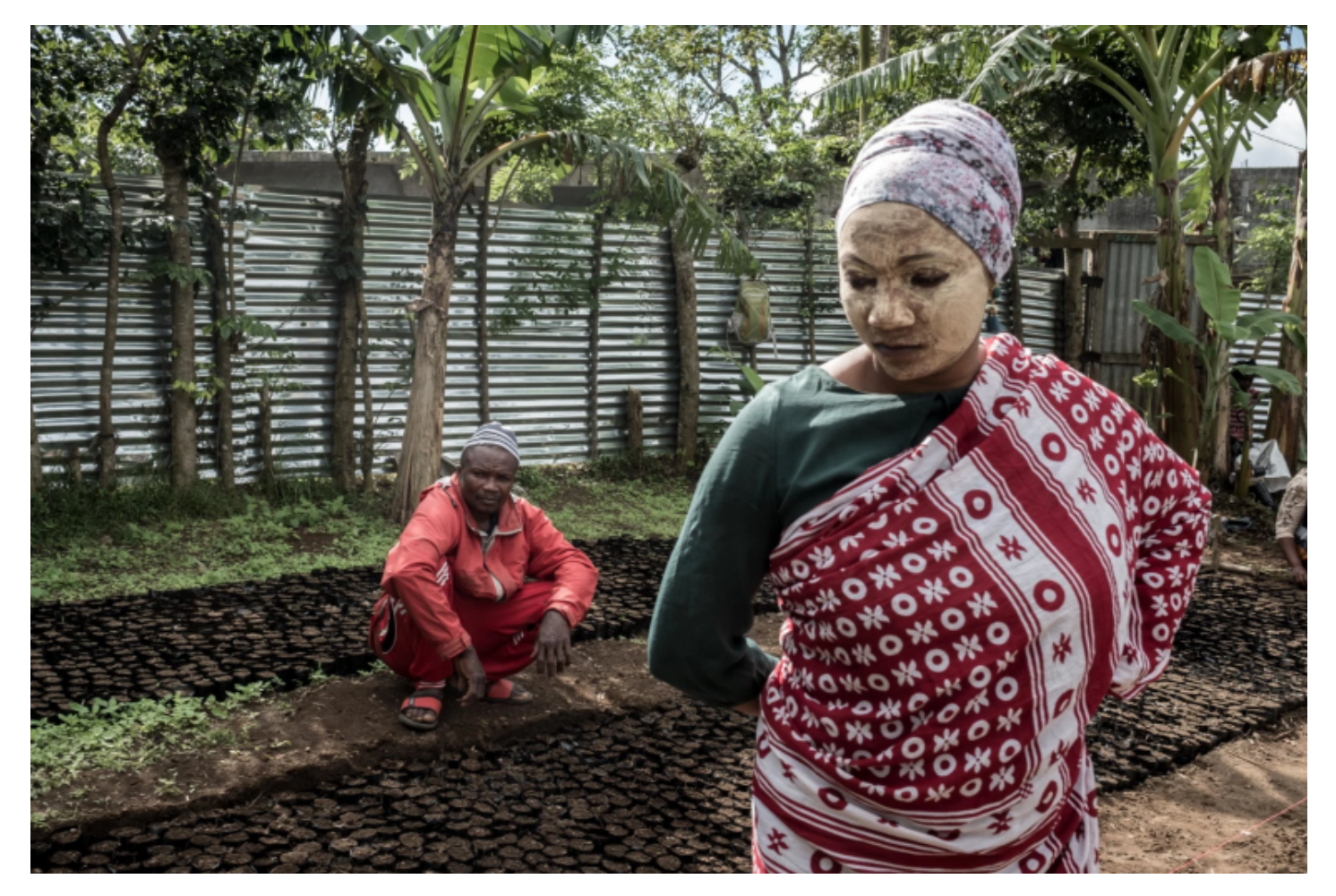
Villagers planted seedlings as part of a United Nations-funded project to restore forest cover on Anjouan. Image by Tommy Trenchard for The New York Times . Comoros, 2019.

The United Nations estimates that just 13 percent of the population in the Comoros now has access to the quality water it needs.