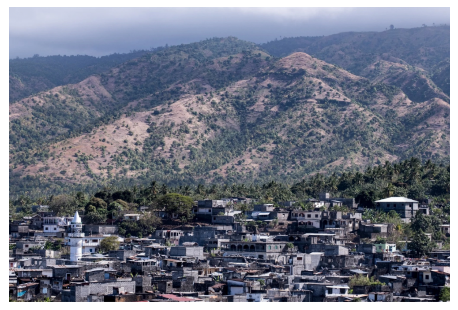
Deforested hillsides on Anjouan. Across the Comoros, deforestation has been rapid in the decades since independence from France. Comoros, 2019.

Environment Program's work on adapting to climate change. "There's a recognition that we need to collectively improve on land management in order to sustain livelihoods and production."